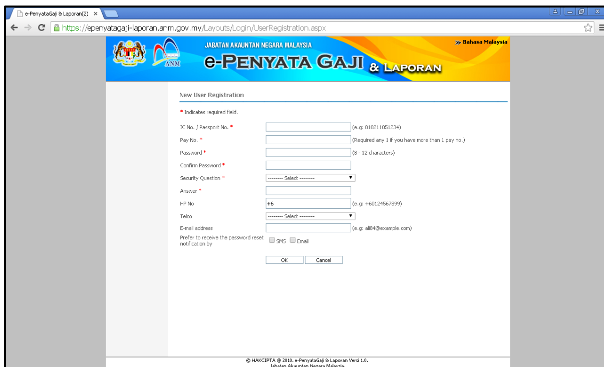
Figure 4: New User Registration Screen for ePayslip & eReports System