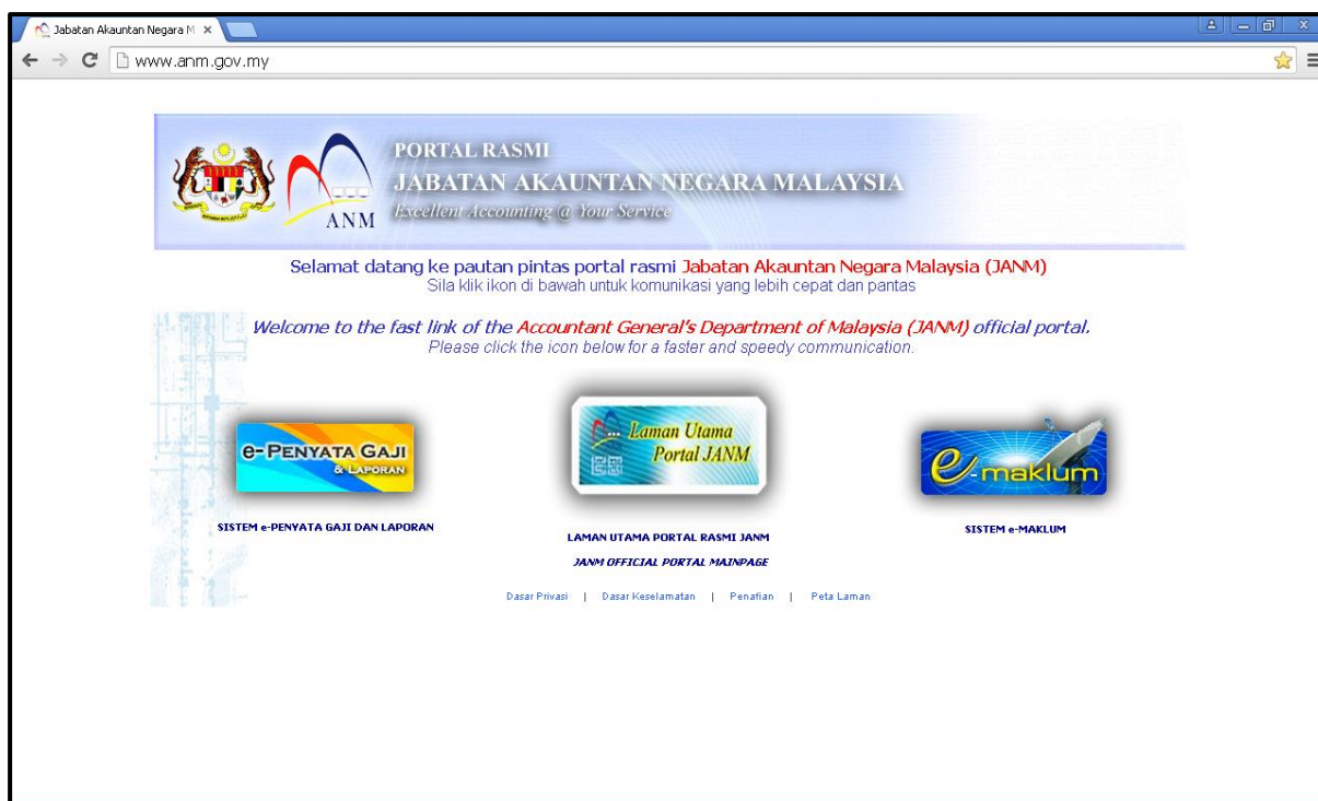
Figure 2: Main screen of AGD's portal anm.gov.my

System can be accessed by browsing www.anm.gov.my and click at ePenyata Gaji icon as shown below.